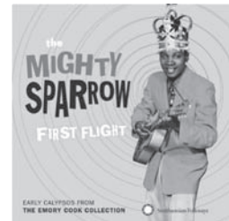
The Mighty Sparrow: First Flight—Early Calypsos from the Emory Cook Collection SFW-CD-40534

Fueled by his experiences in post-war Port of Spain, Mighty Sparrow’s First Flight intertwines spiritual and social concerns resulting in unflinching social commentary. Incendiary and often scandalous, First Flight shatters popularly held perceptions of calypso as merely “party” music.