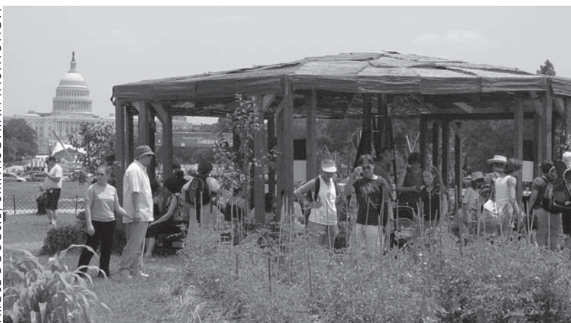
Visitors to the Food Culture USA program examine a bed of tomatoes while others participate in a narrative session in the Ramada at the Edible Schoolyard.