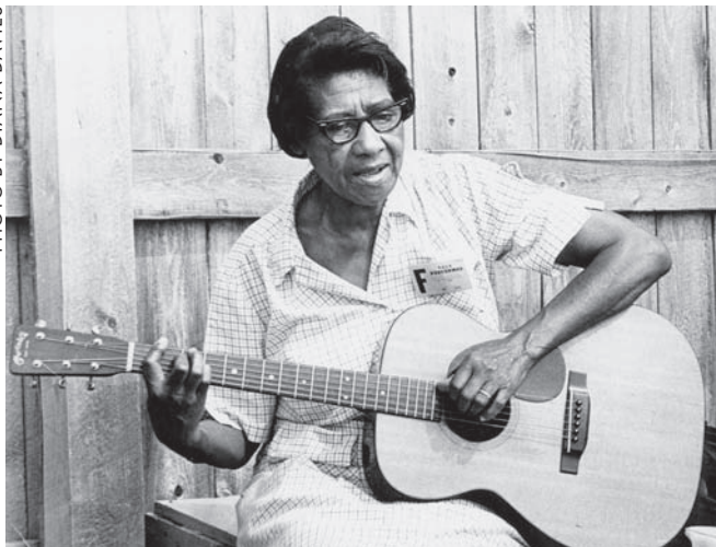
Elizabeth Cotten is a Featured Artist on Smithsonian Global Sound. Her feature includes an essay, sample audio recordings, and a rare, never-before-seen film shot in Pete Seeger's home circa 1957. In this photo she is performing at the 1968 Newport Folk Festival.