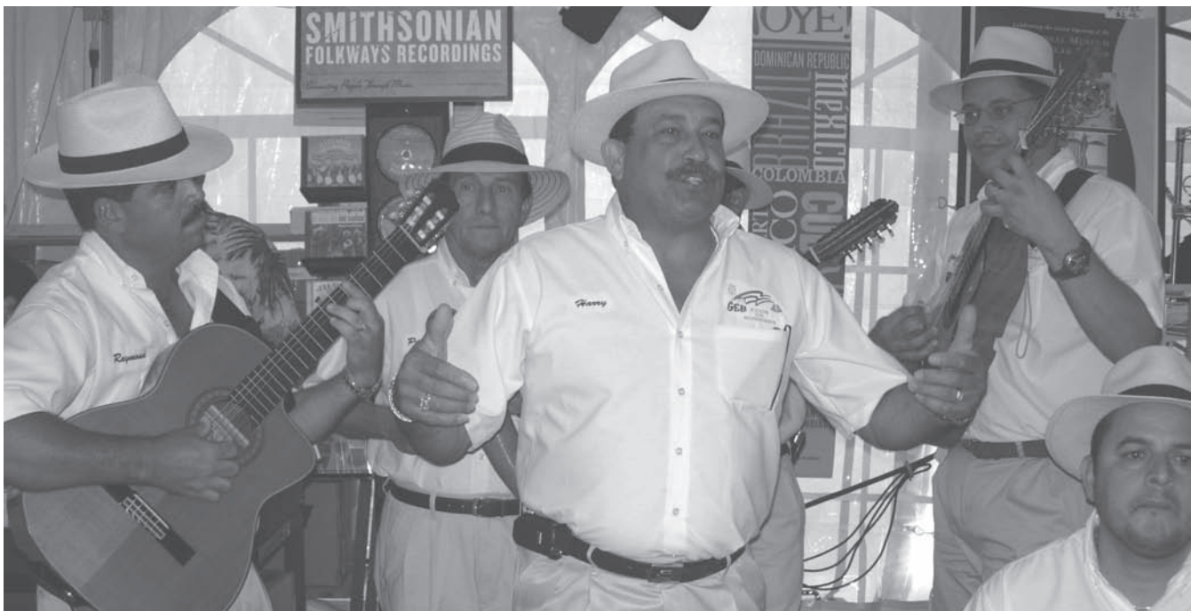
Ecos de Borinquen performs in the Festival Marketplace.