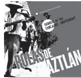
Rolas de Aztlan: Songs of the Chicano Movement SFW-CD-40516