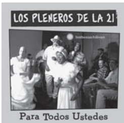
Los Pleneros de la 21: Para Todos Ustedes SFW-CD-40519