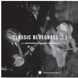
Classic Bluegrass, vol. 2 from Smithsonian Folkways SFW-CD-40163